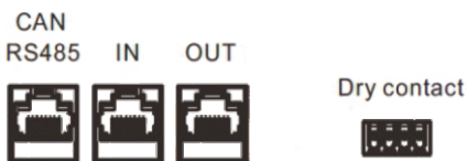
Battery communication interface preview